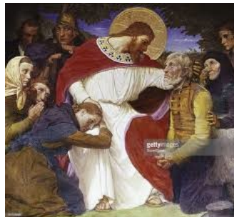
Jesus Comforts His People